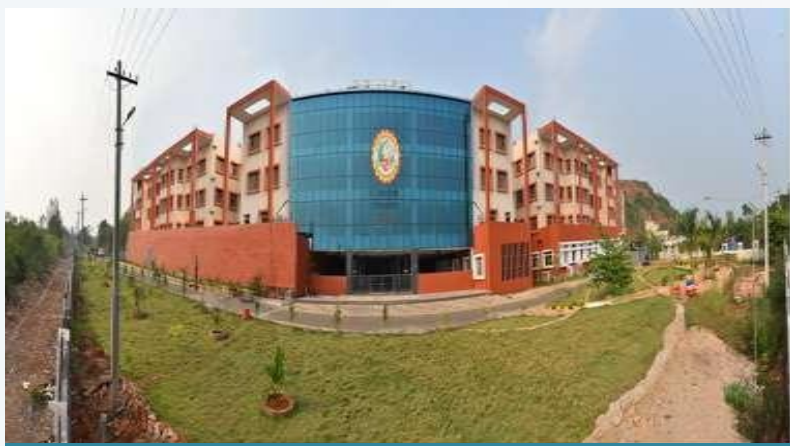
Vizianagaram, AP | 2017