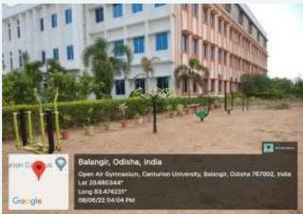
Balangir | 2018