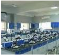
School of Paramedics and Allied Health Sciences