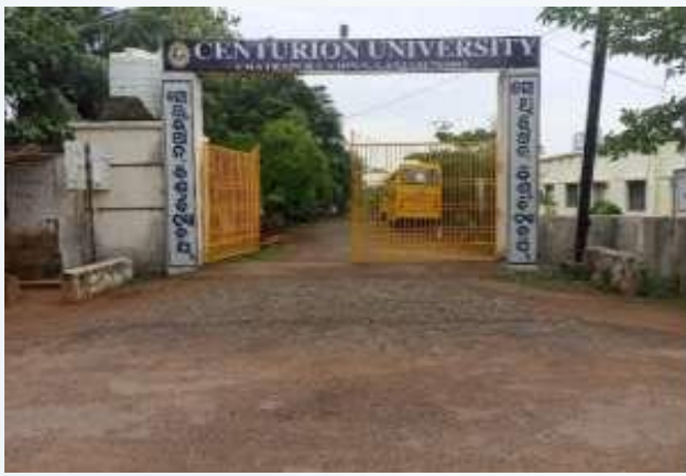
Chhatrapur | 2022