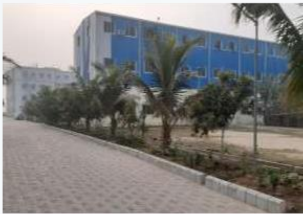
Balasore | 2022