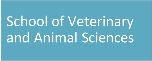
School of Veterinary and Animal Sciences