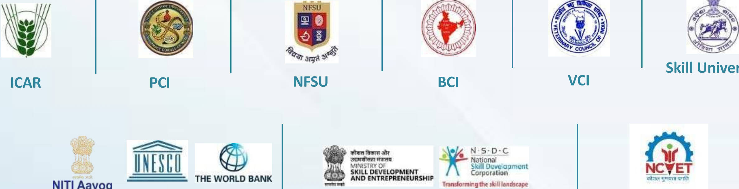
ICAR PCI NFSU BCI VCI Skill University NITI Aayog UNESCO THE WORLD BANK Case Study and Citations CoE by MSDE and NSDC Partner Awarding Body