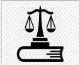
School of Law