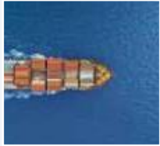
School of Vocational Education & Training