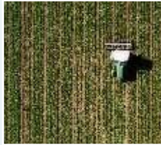
MS Swaminathan School of Agriculture Sciences