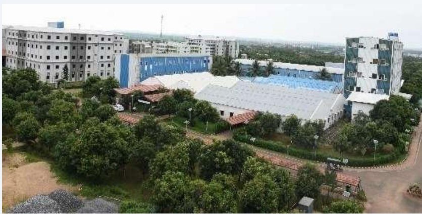
Bhubaneswar | 2008