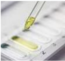
School of Pharmacy