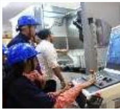
School of Engineering and Technology