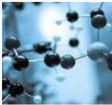
School of Agricultural and Bio-engineering