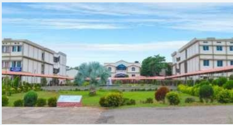
Paralakhemundi | 2005