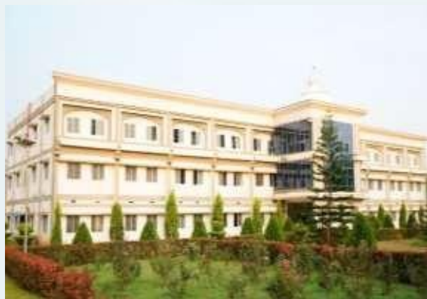
Rayagada | 2018